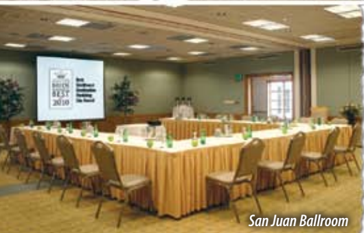
San Juan Ballroom