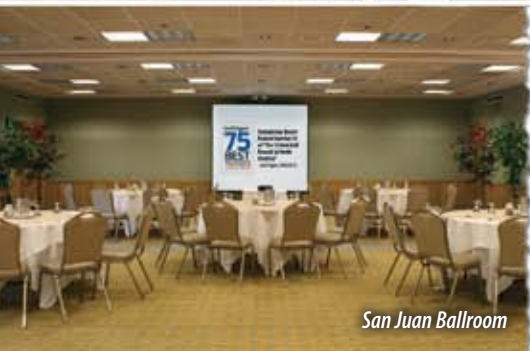
San Juan Ballroom